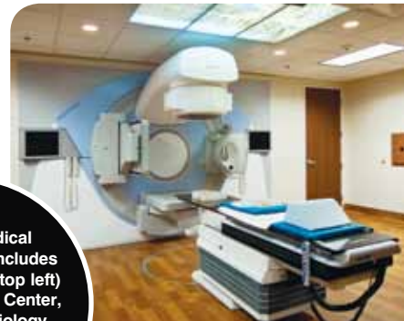
The new medical office building includes (clockwise from top left) the Vista Cancer Center, Advanced Radiology Oncology Center and Illinois Bone & Joint Institute.